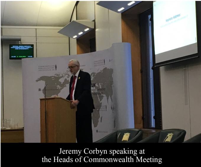
Jeremy Corbyn speaking at the Heads of Commonwealth Meeting

The Commonwealth Heads of Government Meeting recently took place in London and Windsor, where Commonwealth leaders met to discuss how we will jointly face global challenges in the future.